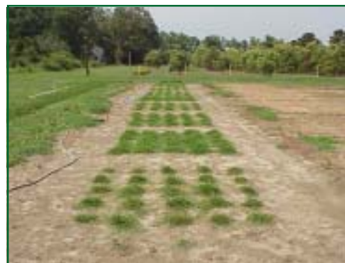
Left SSCE Test Plots like this one are in place at 21 U.S. sites.